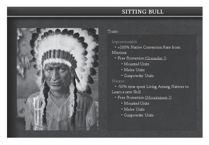
FIGURE 6.5 Leader Traits for Sitting Bull in the Civilopedia

The Sioux, for example, have a free promotion called "Grenadier I" that allows mounted, melee, and gunpowder units to have increased power when attacking settlements. As previously mentioned, however, Natives must first acquire guns and horses through trade with the player or other colonial powers. These militaristic bonuses could still be beneficial to the player if he or she were allied with the Natives possessing guns and horses. If players