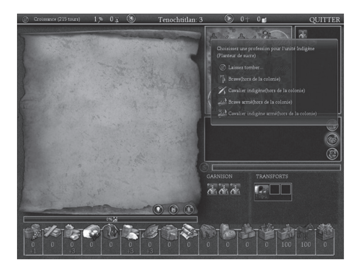
FIGURE 6.2 A Settlement of Natives showing the lack of activity of such settlements

The screenshot of Tenochtitlan was taken by Robert Surcouf, who quite eloquently captures the sentiment of the situation in his comment: "There is not much in Tenochtitlan, but it belongs ... to me;" The ghost town in Surcouf's Aztec settlement explicitly shows the limitations placed on different