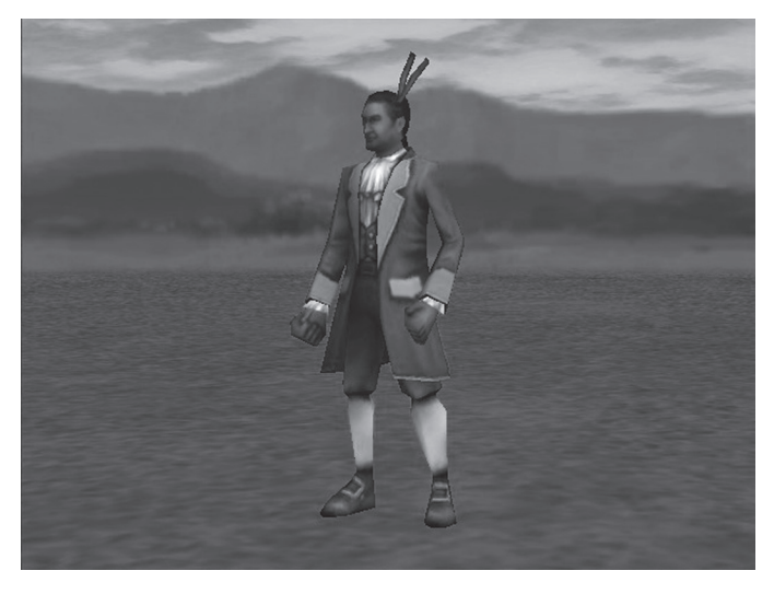
FIGURE 6.3 Various Stages of "Conversion" of "Natives"