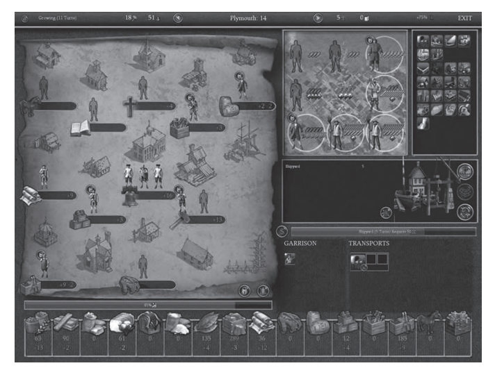
FIGURE 6.1 A Working Settlement in the New World emphasizing European Settler's Activities